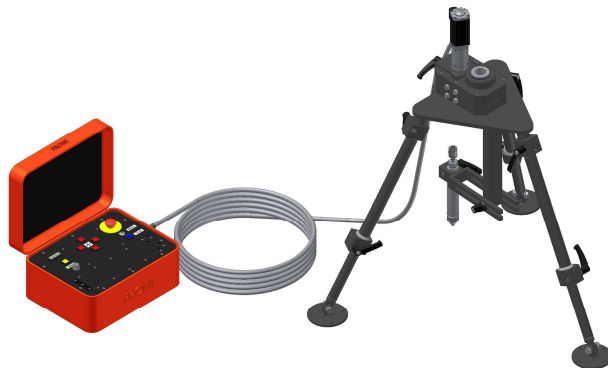
Option: Universal Fixing Module for Circular Cutter

Application for circular cutting holes by WAS cutting